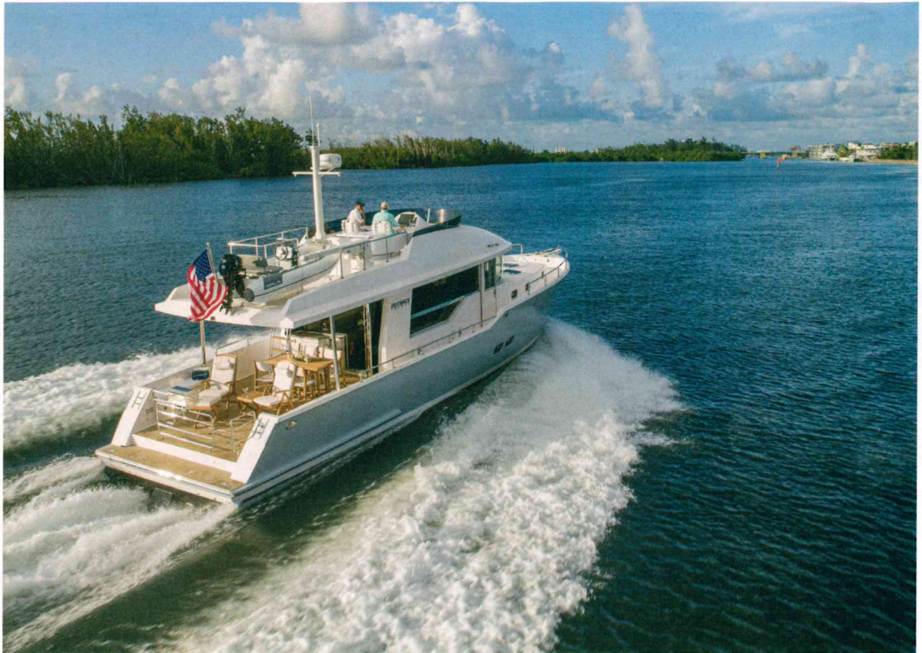
The Outback 50 combines the feel of being aboard a trawler yacht with the ability to cruise faster than 20 knots.

selling are able to withstand the scrutiny of a hull surveyor as well as a diesel mechanic as part of an inspection.